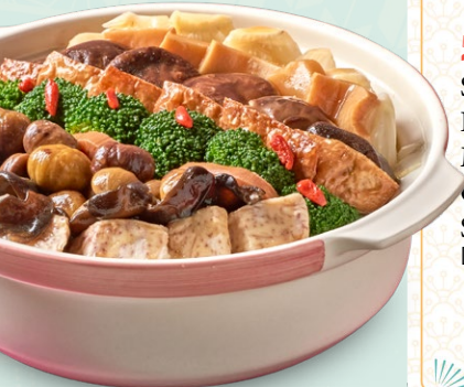
Vegetarian Treasure Pot

B Choose one item each from 1 to 10 Min 30 guests, 10 courses $28.99 /Guest $31.60 w/GST