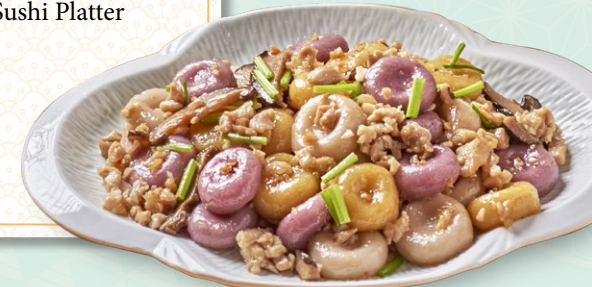
Hakka Abacus Seeds

B Choose one item each from 1 to 8 + 9B Min 30 guests, 9 courses $24.99 /Guest $27.24 w/GST