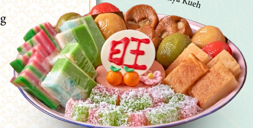
Assorted Nonya Kueh

B Choose one item each from 1 to 10 Min 30 guests, 10 courses $30.99 /Guest $33.78 w/GST