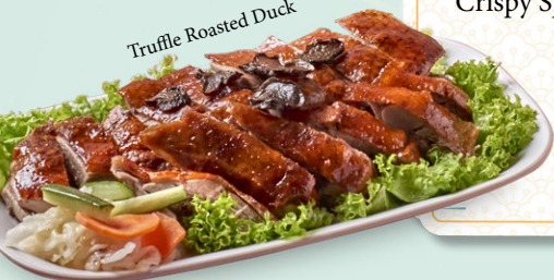
Truffle Roasted Duck

B Choose one item each from 1 to 8 + 9B Min 40 guests, 9 courses $21.99 /Guest $23.97 w/GST